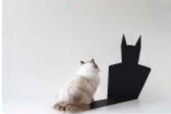
A ranch cat

You often hear of dogs protecting farm animals from coyotes, but have you heard of a cat doing the same?