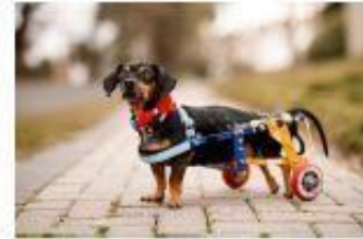
Dixie with wheels

Dixie became paralyzed and now uses a wheelchair. Dixie's owner says she plans to take the other dog owner to court.