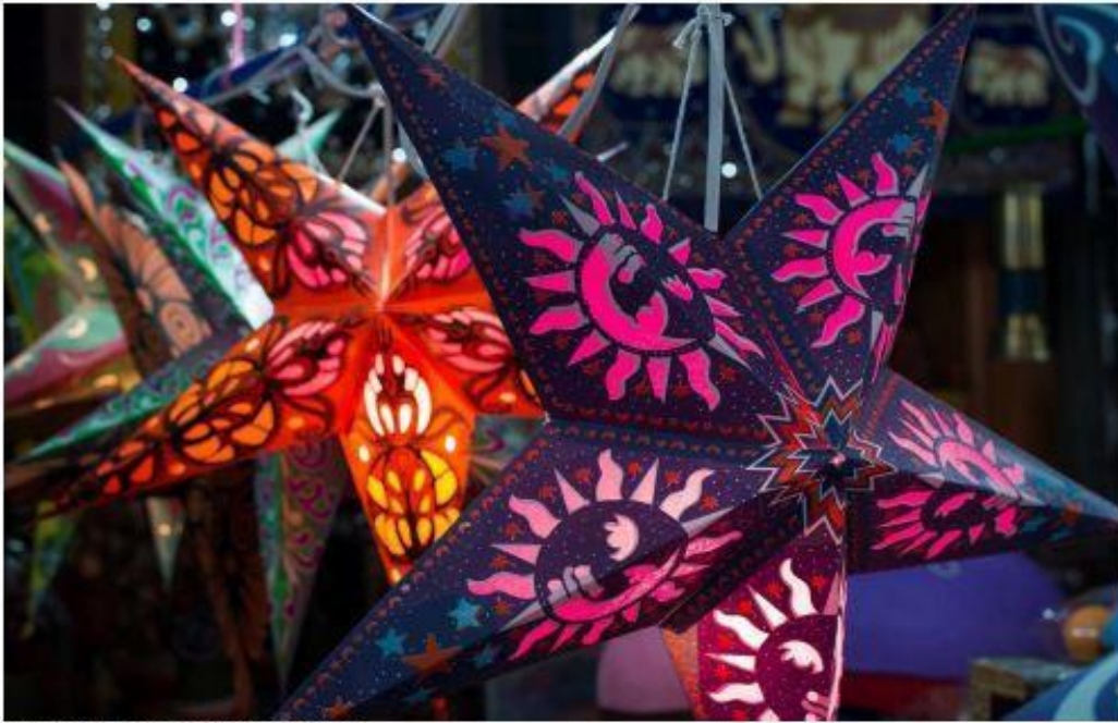
Stars: Lamps shaped like stars for Lunar New Year