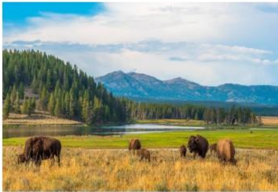
Yellowstone Park: A family of bison grazing

The tourist was airlifted to the nearest hospital. They are in critical condition. Park officials say that before entering the park, visitors are given a lesson on how to behave inside the park.