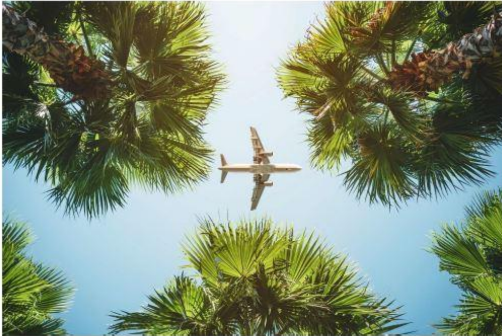
Flying High: An airplane takes off from St. Pete-Clearwater International Airport